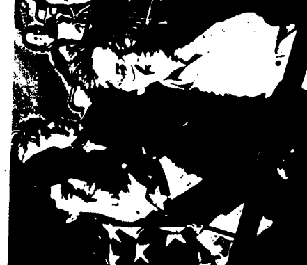
roller coaster Epcot with famous host