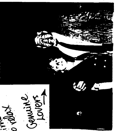
Time to relax Genuine Lovers