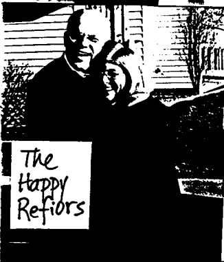
The Happy Refiors