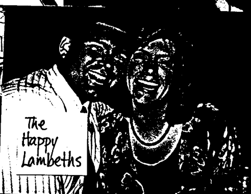
The Happy Lambeths