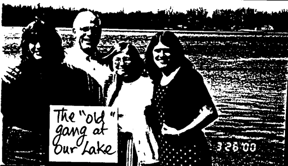
The "old" gang at our Lake